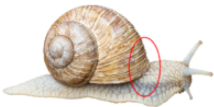
BOURRELET DU MANTEAU