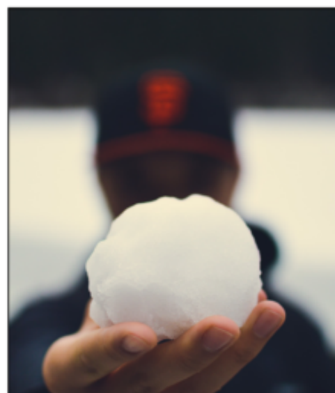
BOULE DE NEIGE