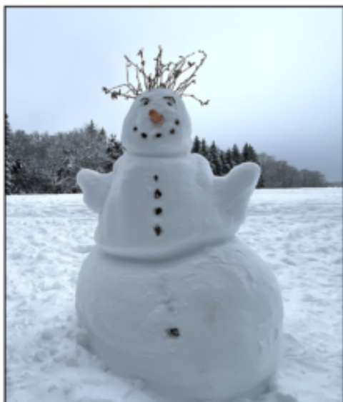
BONHOMME DE NEIGE